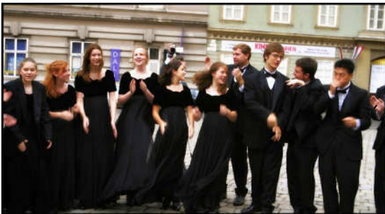
The Oregon Youth Chorale