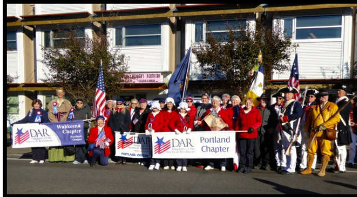
The chapter Color Guard participated in the Veteran's Day parade in Portland's Hollywood District along with our DAR friends.